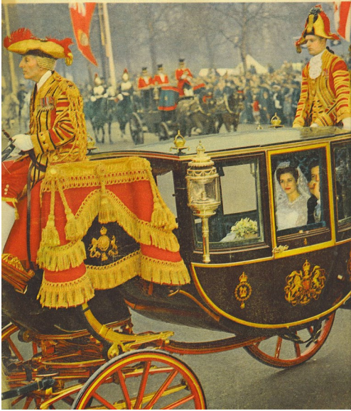
Princess Alexandra and Angus Ogilvy