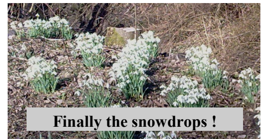
Finally the snowdrops !

If there is anyone out there who would like spend some time chasing grants on our behalf, and release the Curator to do his real job, please let us know