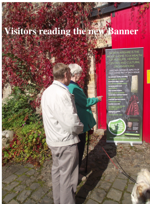
Visitors reading the new Banner

It is a feather in our cap and a bonus for all our hard work. The pity is that the grants that were to help make it happen, have been withdrawn, so the ceilidhs, and Farmer's Markets etc. will have to wait.