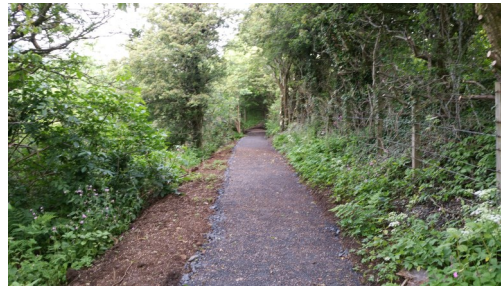
Reaching new heights