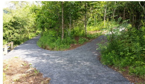
A parting of the ways