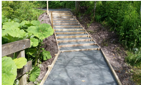
The new easy steps with handrail.

Our sincere thanks to North Ayrshire Council's Land Fill Tax Fund, EN trust, East Ayrshire Woodlands and the contractors for the new revised path Do try it!