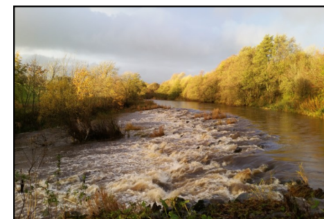
Storms and flooding November 2015

Our thanks, to all the customers, old and new who fought their way off the main road to keep us company.