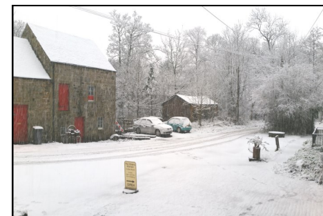
Snow in January 2016